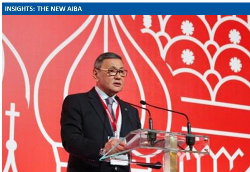
Gafur Rahimov elected as AIBA President at the 2018 AIBA Congress in Moscow